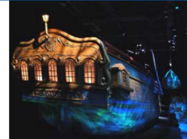
Cape Cod, MA Whydah Pirate Museum