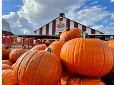
Portland, OR Pumpkin Patch on Sauvie Island