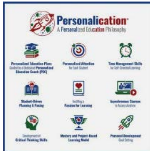
TRANSFORMING EDUCATION AT CMASAS

Positive and productive environments are built from these three words: engagement, leadership, and community. One might ask how these three words are related. Effective leadership can foster engagement and build a strong community, while an engaged community can produce effective leaders. ( read more ).