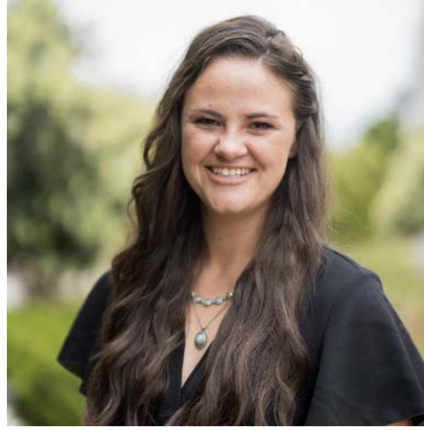
High School Lead