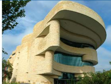
Washington D.C. American Museum of the American Indian