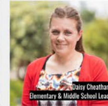
Daisy Cheatham Elementary & Middle School Lead