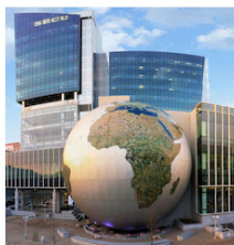
Raleigh, NC Museum of Natural Science