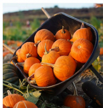
Portland, OR Pumpkin Patch on Sauvie Island