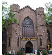
Salem, MA Salem Witch Museum