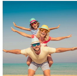
June 28- July 11 Summer Break