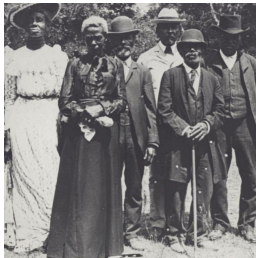
June 19: Juneteenth