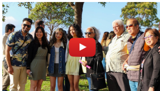
NHS Induction Ceremony Video