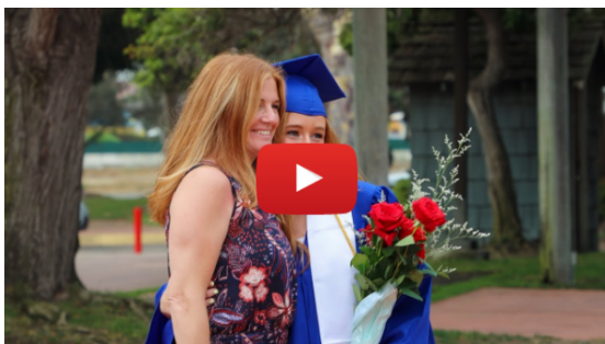
Graduation Ceremony Video