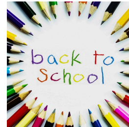
July 21: First day 25/26 School Year